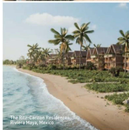
The Ritz-Carlton Residences, Riviera Maya, Mexico

beachfront villas, one condominium, and one townhome. Prices for available properties range from $7 to $12 million. Residents have access to a Jack Nicklaus Golf Course and Quivira Golf Club, seven resort pools, a spa, fitness center, and dining