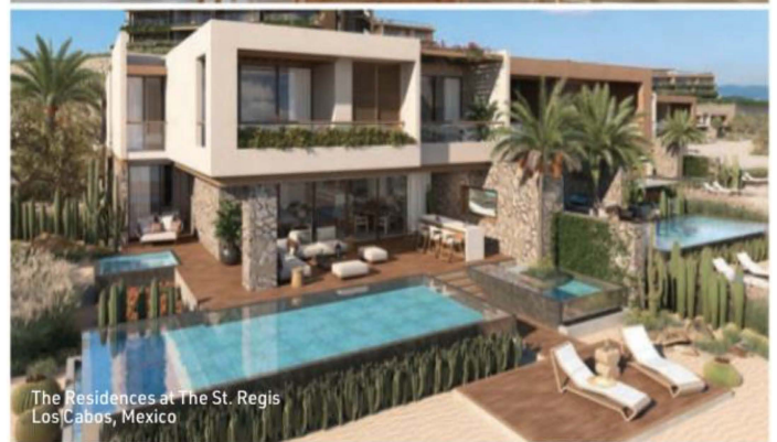
The Residences at The St. Regis Los Cabos, Mexico