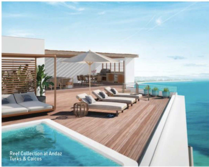
Reef Collection at Andaz Turks & Caicos